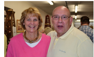
Amazingly, Republicans and Democrats (legislators and undertakers) CAN get along!