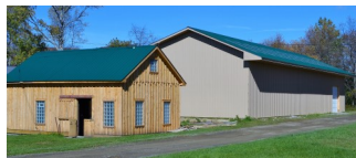
(The Joyce Building is the longer building on the right.)