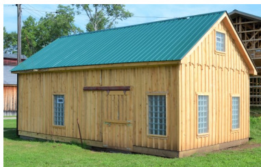
Before and after pictures of the first renovated threading building mentioned in the article on page one; this project was supported by Joe Bucher