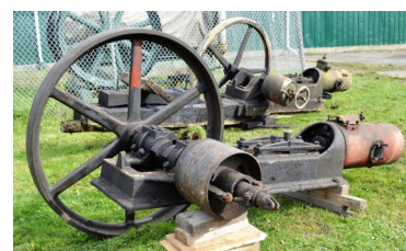
Two engines donated by Chip McCracken mentioned in the article