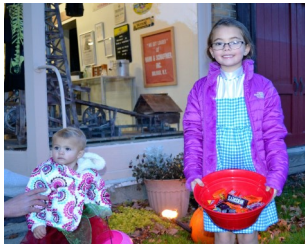
Trick-or-Treaters visited the museum on Halloween night