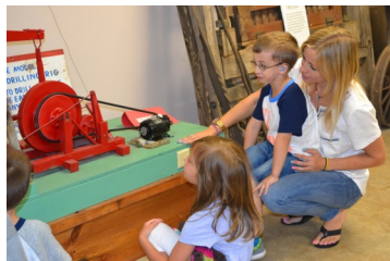
Moms brought children of all ages to the museum when the Empire State Water Well Drillers visited