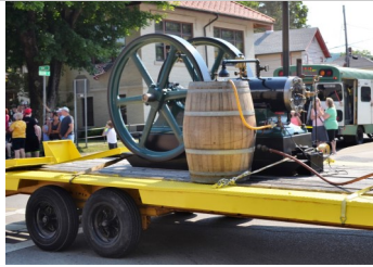
One of the oil-related floats in the parade