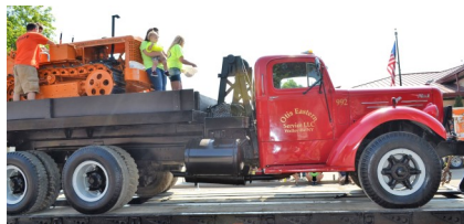
A float from Otis Eastern in the Pioneer Oil Days Parade