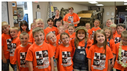
Students from Bolivar-Richburg Elementary School visited the museum in June