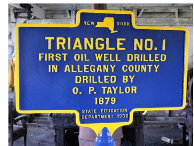
The restored sign that will be placed at the Triangle No. 1 site as part of the renovation process described on page one