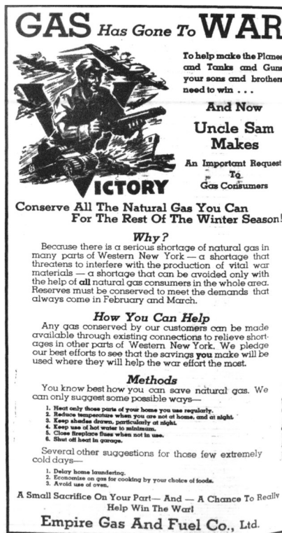
A 1943 Bolivar "Breeze" Ad