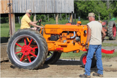
The tractor pull during Pioneer Oil Days went off without a hitch